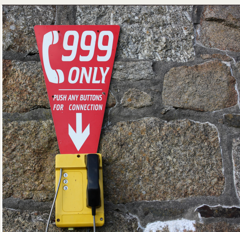
Call 999 in Emergencies