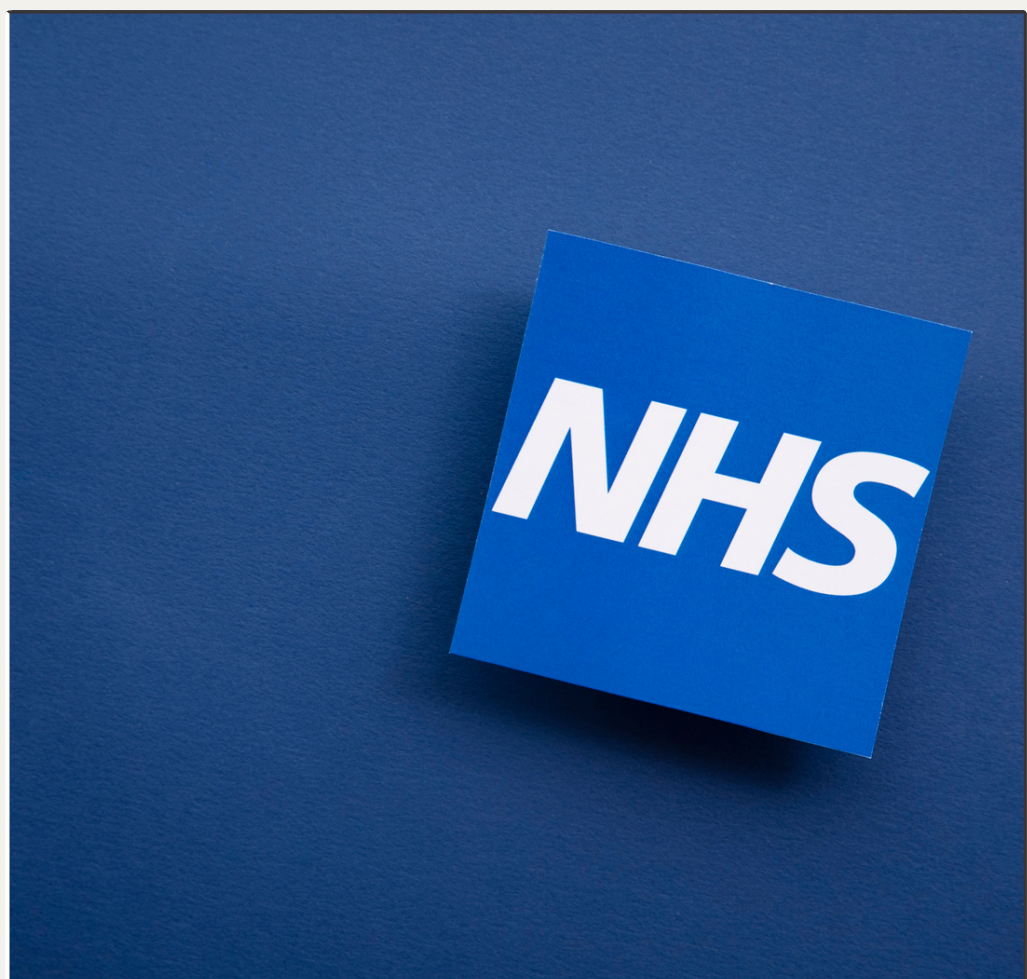
GPs, Hospitals, Healthcare Providers