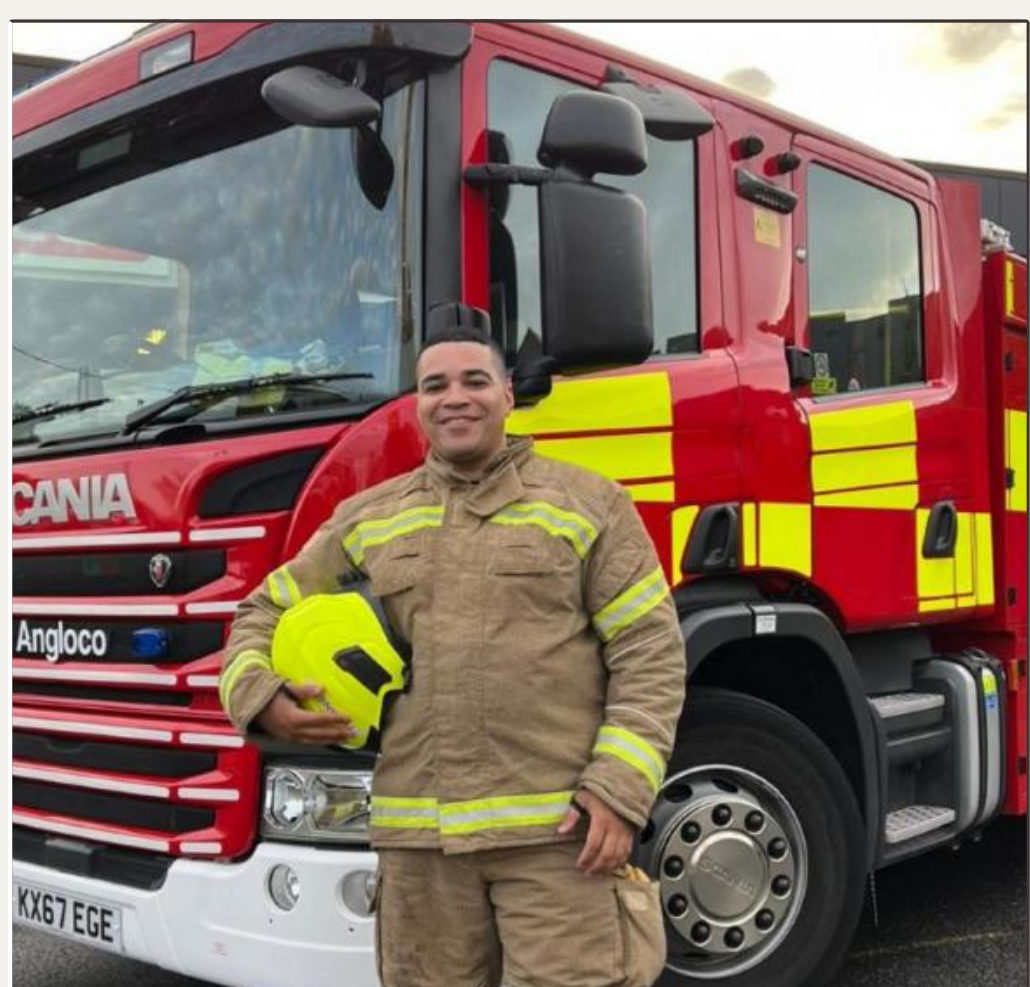
Fire and Rescue